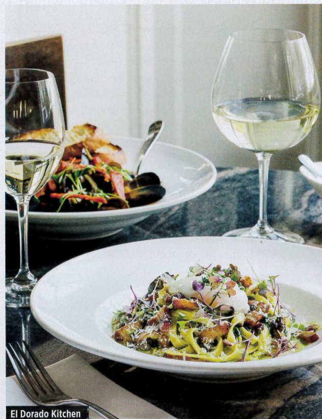
El Dorado Kitchen