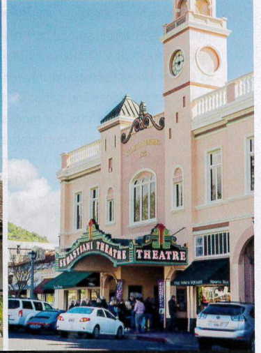
From left: Historic portrayal at Buena Vista winery; Mission San Francisco Solano, part of Sonoma State Historic Park; Sebastiani Theatre, built in 1933

Sonoma Mountains to the west, the valley spans 17 miles from the vine-clad rolling hills of Carneros in the south to its northern tip on the border of the city of Santa Rosa. The Sonoma Valley AVA also includes the four subappellations Sonoma Mountain, Moon Mountain, Bennett Valley and Los Carneros, and their many microclimates allow a variety of grapes to be grown.